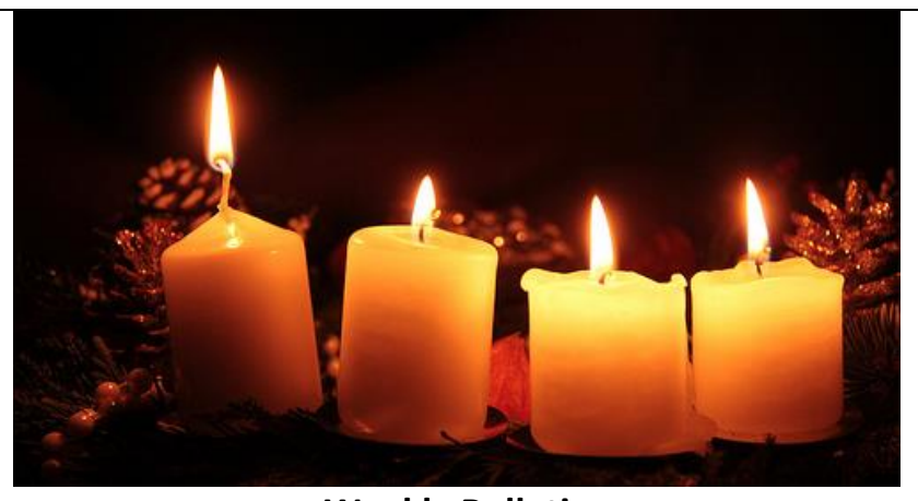
Weekly Bulletin St. Aloysius and St. Columban Bulletin 4th Sunday of Adent