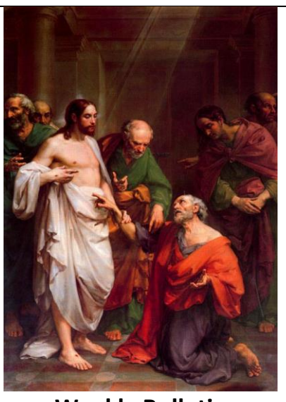
Weekly Bulletin St. Aloysius and St. Columban My Church, My Community, My Friends