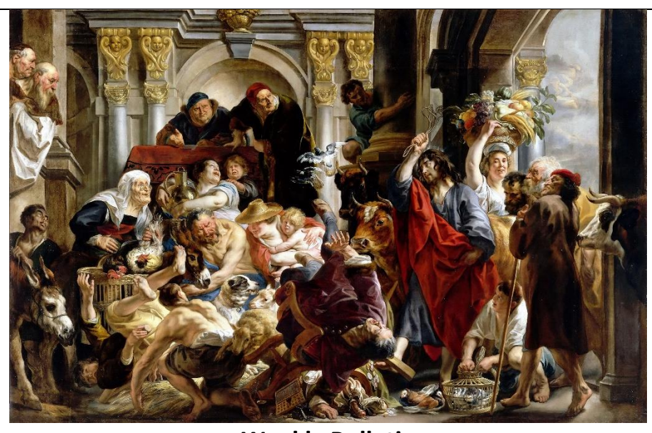
Weekly Bulletin St. Aloysius and St. Columban My Church, My Community, My Friends